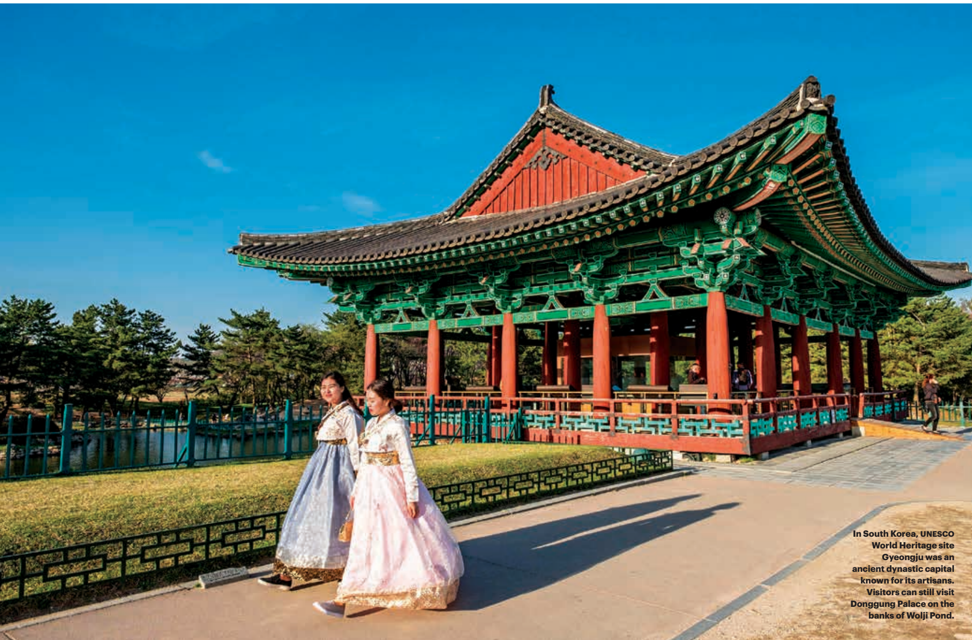
In South Korea, UNESCO World Heritage site Gyeongju was an ancient dynastic capital known for its artisans. Visitors can still visit Donggung Palace on the banks of Wolji Pond.

T o unlock the secrets of a faraway place, it helps to have an expert guide by your side. For more than 10 years, Traveler has tracked top outfitters and tour companies that illuminate the world. What differentiates the very best trips? Small groups, knowledgeable guides, a well-curated itinerary, a sensible pace, and sustainable practices. In this issue, we look eastward for new discoveries that—to paraphrase the great 14th-century explorer Ibn Battuta—will leave you speechless and then turn you into a storyteller.