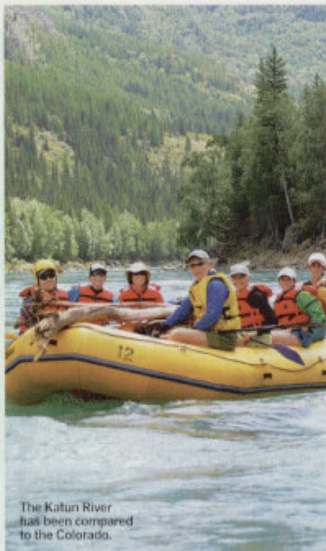
The Katun River has been compared to the Colorado.

SIBERIA COVERS 77 PERCENT OF Russia, with 4 million square miles of wilderness and more than 40,000 rivers. One of the best to run is the Katun, in the south, which flows at increasingly high levels thanks to glacial runoff from Mount Belukha, Siberia's second tallest peak. The area's bigger, badder rafting has lately been great for business. "Ten years ago you didn't see any lodges or infrastructure near the river, and now it's a boomtown," says Marc Goddard, of Bio Bio Expeditions. Sixteen-day river trips include time in Moscow, overnight stays outside Barnaul (a four-hour flight from Moscow), and a trip on the old spice route between Siberia and Mongolia before riding Class III-IV rapids (16-day trips from $2,900; bbrafting.com ).