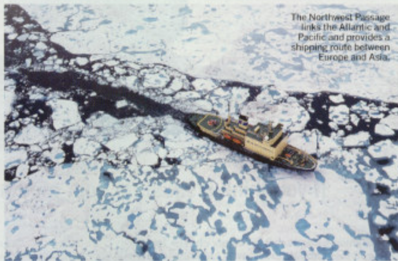
The Northwest Passage links the Atlantic and Pacific and provides a shipping route between Europe and Asia.